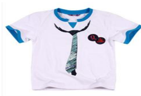
Figure 1: Static plane picture.

The web page display of clothing in e-commerce is divided into three stages. The first stage is plane display, and the second stage is "changeable" plane pictures. At present, China's clothing display is in this stage, the mouse on the local, local will become larger. The third stage has not been fully realized at present, only a few enterprises in Hangzhou have cited the "3D interactive virtual fitting room" technology. It is believed that with the innovation of technology, the 3D experiential virtual fitting system customized will be selected by more enterprises. (figure 2.15)