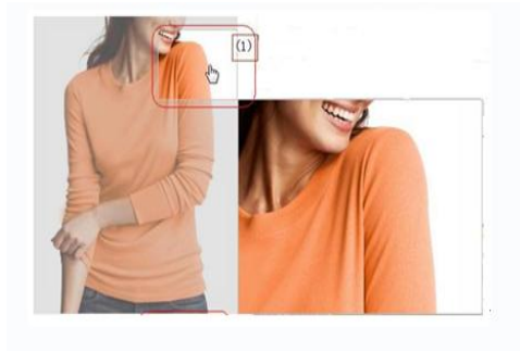
Figure 2: "changeable" plane picture".